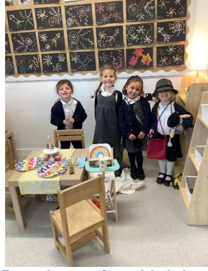
Dressing up for a birthday