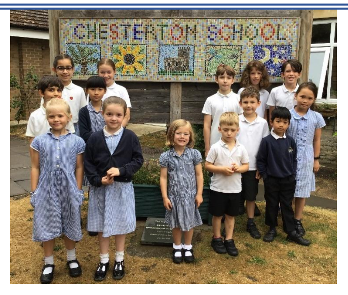
Term 5 Gold Certificate Winners

Here are our other major certificate winners for this academic year: