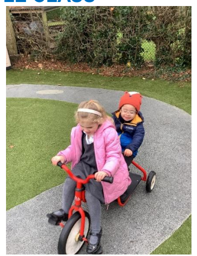
Fun on the trikes