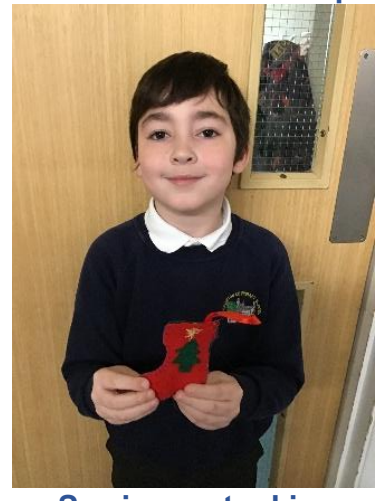
Sewing a stocking