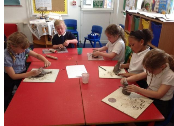
Sculpting Clay Aliens