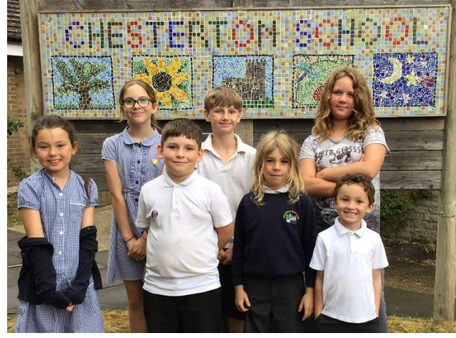
July's Marvellous Mathematicians