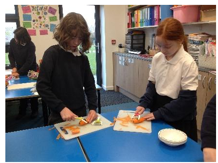
WWII Rationing Soup