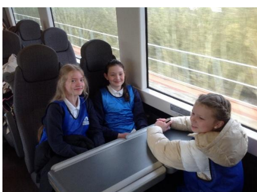
On the train to Oxford