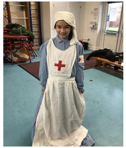
World War II Day