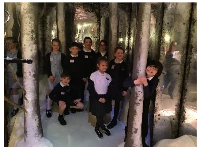
The magical Story Museum