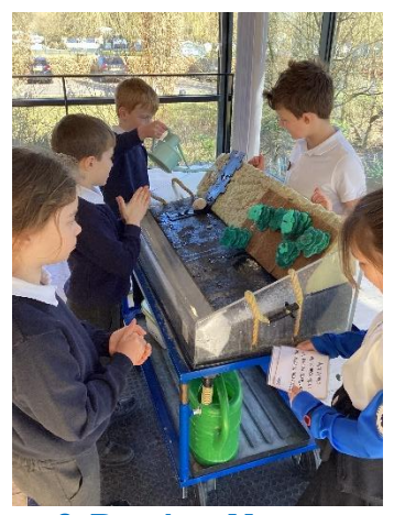
River & Rowing Museum