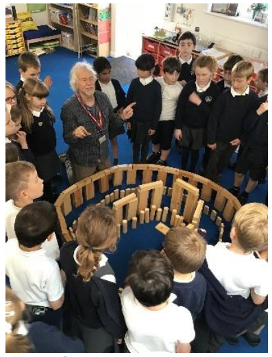
Stone Age Day