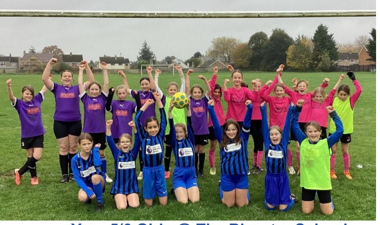
Year 5/6 Girls @ The Bicester School