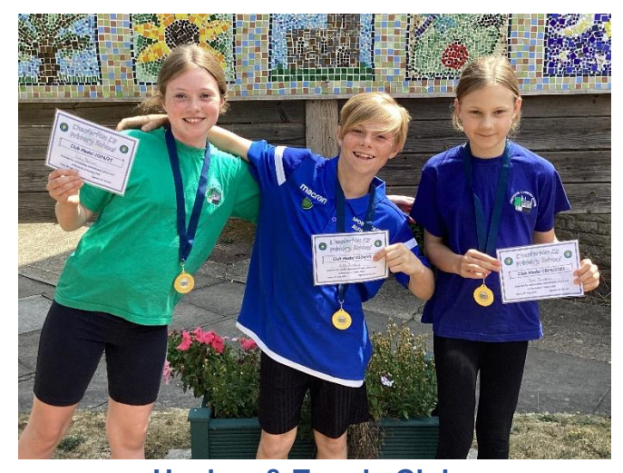
Hockey & Tennis Club