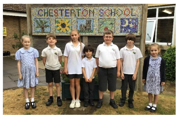
July's Amazing Authors