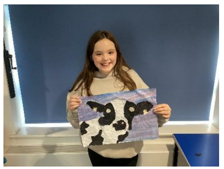
Collage in Art