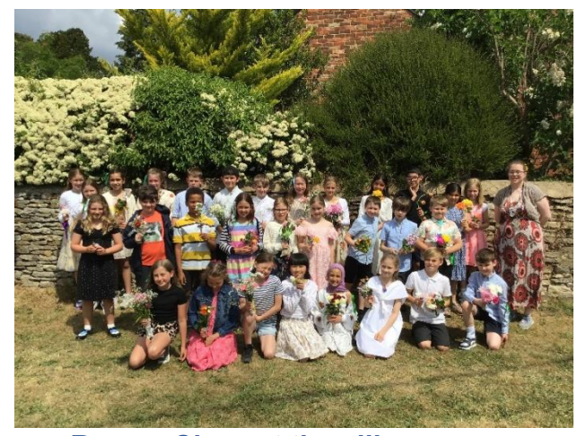
Rowan Class at the village green