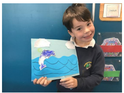
DT Pictures with Levers