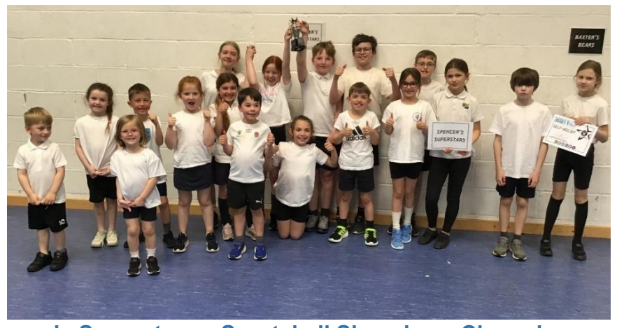
Spencer's Superstars – Sportshall Showdown Champions again!