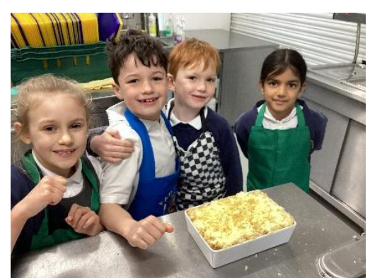
Cooking Cottage Pie