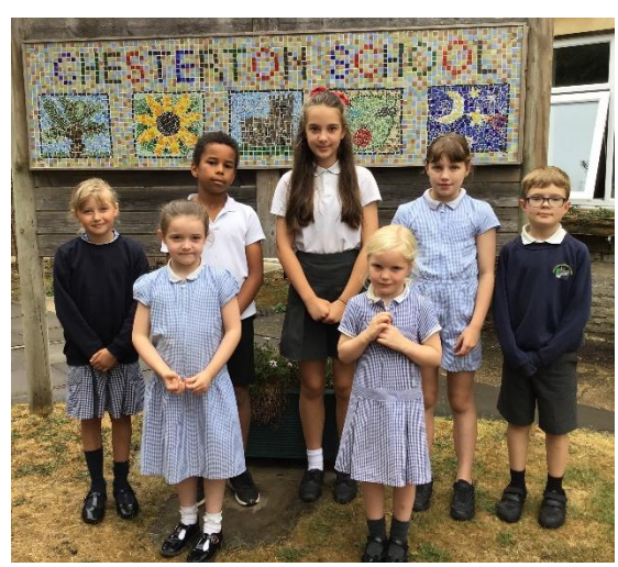
July's Magnificent Musicians