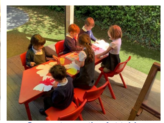
Symmetry on the Art table