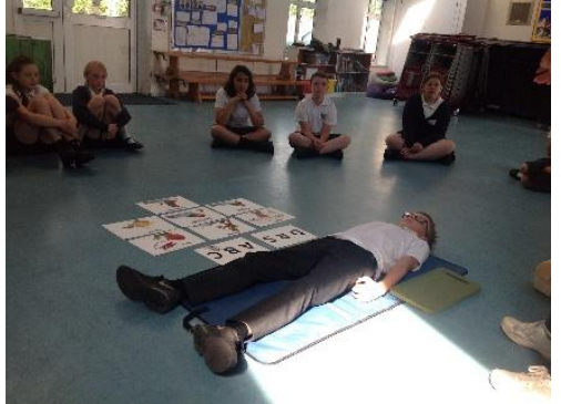
I.M.P.S First Aid