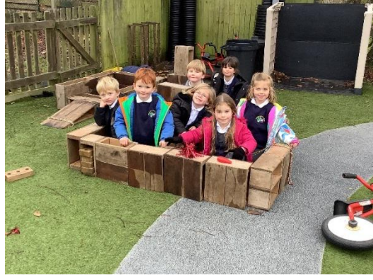
Fort building in the Maple garden