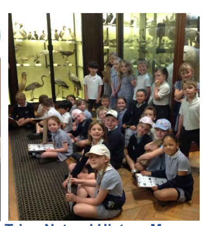
Tring Natural History Museum