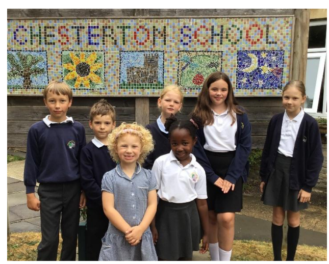
July's Handwriting Heroes