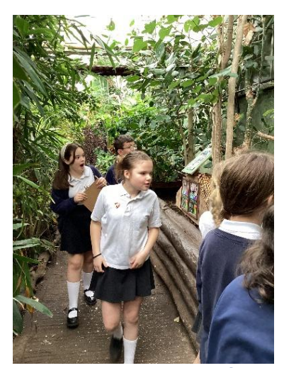
The Living Rainforest