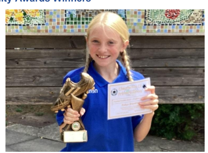
Golden Boot Winner